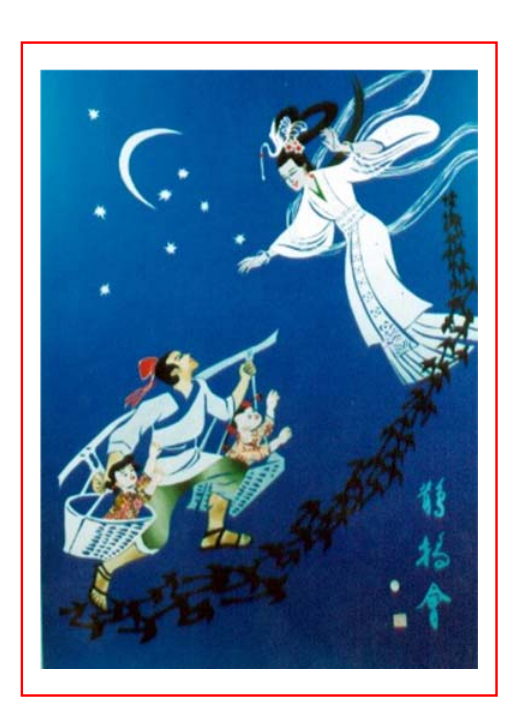
▲ Niulang and Zhinv meet on QiXi festival